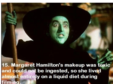
15. Margaret Hamilton's makeup was toxic and could not be ingested, so she lived almost entirely on a liquid diet during filming.

filming (one of the witch's guards accidentally stepped on her). She was paid a $125 a week, which was more than many of the Munchkin actors received.